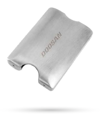
Alluminium Card wallet is cast from recycled aluminium which also gives your cards extra protection with its RFID shield.