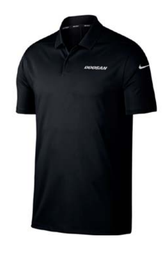
59,5 EUR Public Price