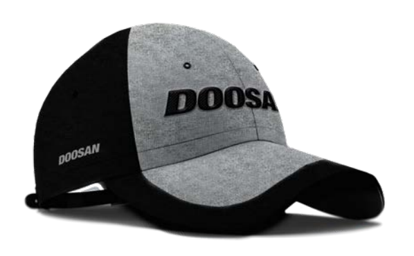
Black Grey Public Price 12 EUR