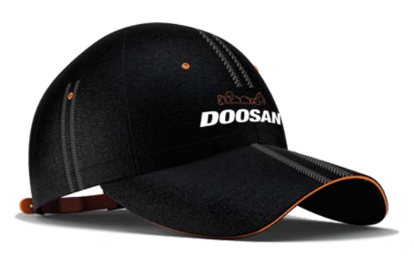
Tracks Public Price 13 EUR