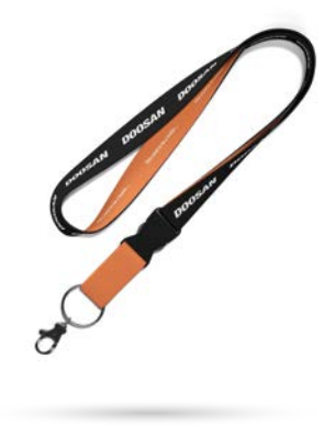
This used to be a plastic bottle.