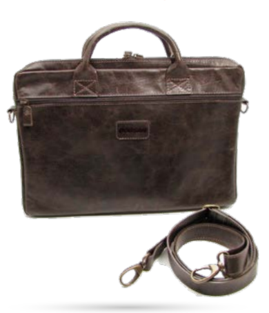
Premium Leather Bag Brown