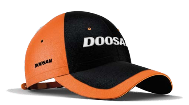
Public Price Orange Black 11,5 EUR