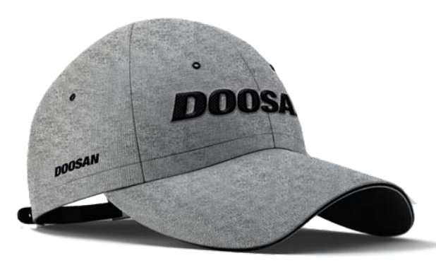
Grey Public Price 12 EUR